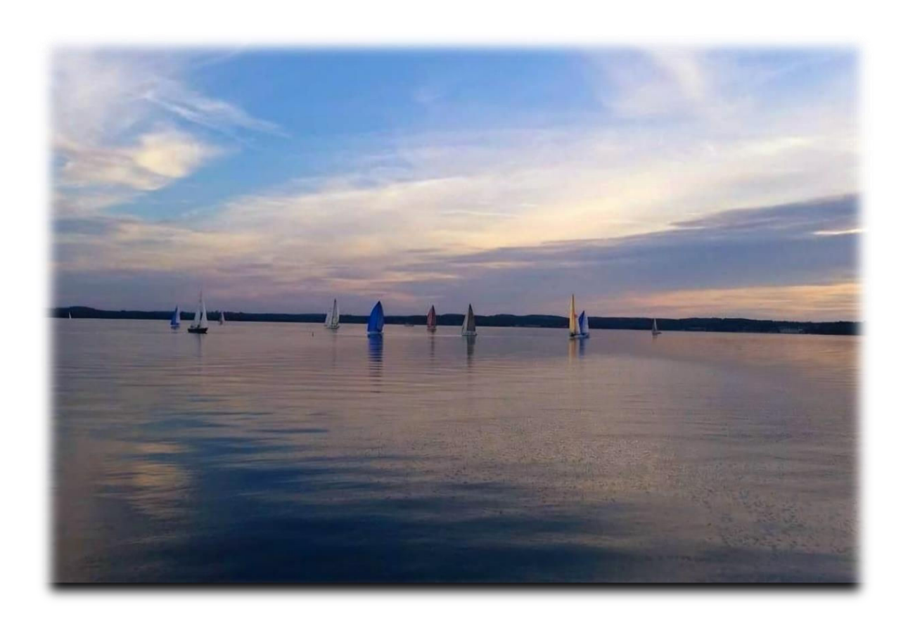
Round Lake on Lake Charlevoix